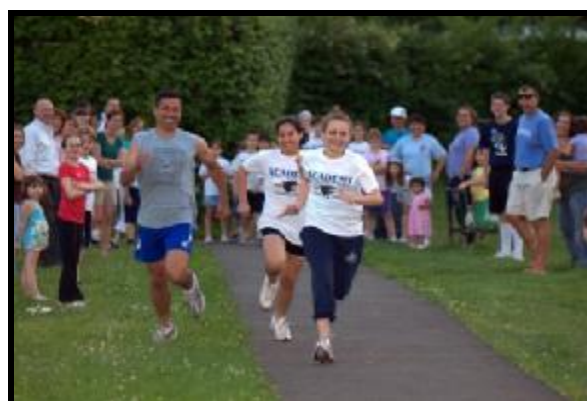
Parents and students raced each other during the Track & Field celebration last week. The fun ended with an ice cream social in the cafeteria.