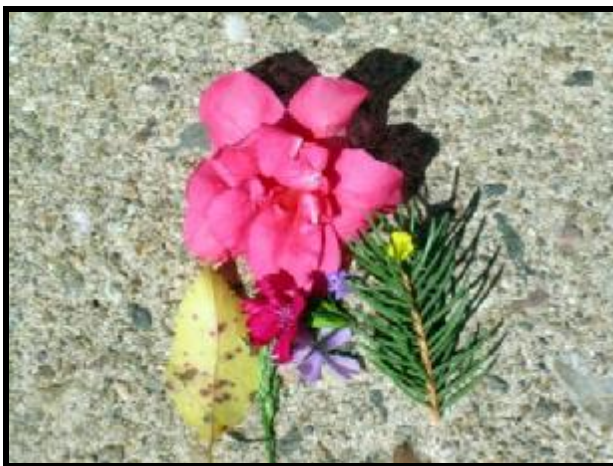
A 5th grader took this digital photograph during a photography project in Computer class!

Each child will be receiving a math review packet which incorporates concepts students should understand when entering the fifth grade. Please have your child review, complete, and return the packet to his/her math teacher in September.