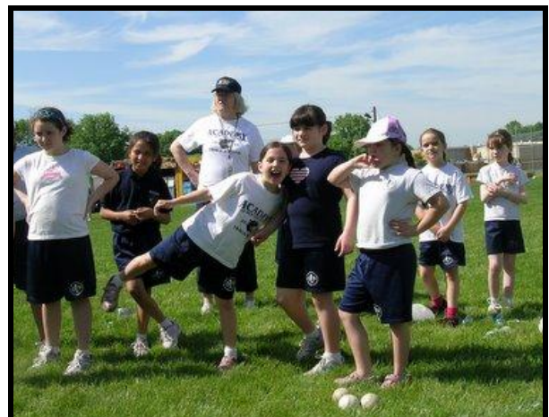
Third graders waiting their turn for "softball throw" during a fun Field Day celebration!