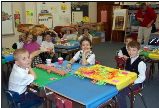
1st Graders anxiously awaiting their parent “customers” during the Mexican Market Day!