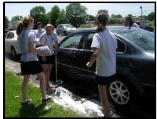
Eighth graders washed faculty cars their last week of school after losing a bet back in Feb.!