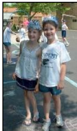
Second graders enjoy the festivities at the Academy’s Memorial Day Barbeque!

Summer’s Coming - A book can be your new best friend!