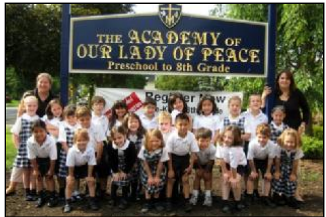
Congratulations to our Kindergarten Graduates!